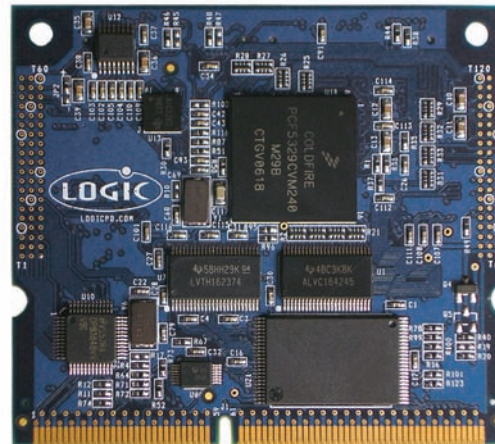
FREESCALE MCF5329 FIRE ENGINE

The MCF5329 Fire Engine is ideal for applications in the medical, point-of-sale, industrial, and security markets. From patient